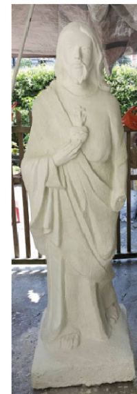
The Sacred Heart of Jesus Missionary Charity Bridgeport In-progress