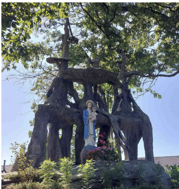
Đức Mẹ La Vang Saint Margaret’s Shrine Bridgeport, 2005